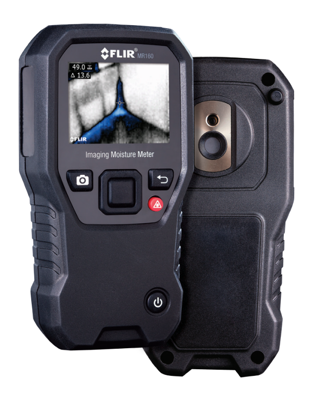
Scanning ceiling & wall joint for moisture issues